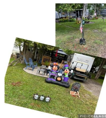
Third Place: Lot #2