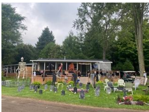
First Place: Lot #334