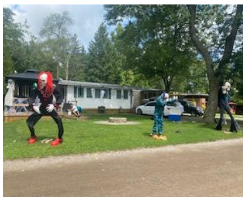
Second Place: Lot # 87